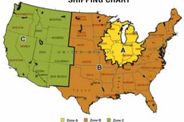
Zone A Zone B Zone C